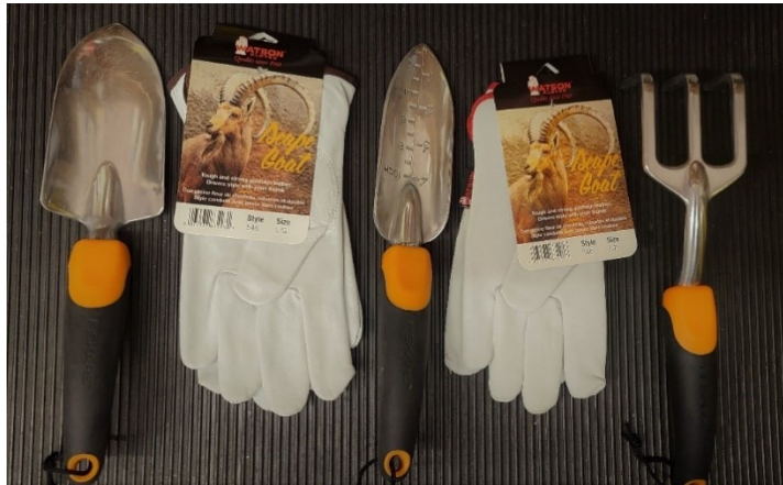
GARDEN GLOVES AND TOOLS READY FOR SPRING PLANTING AT ÉCOLE ROBERT H. SMITH SCHOOL