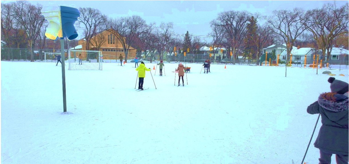
RHS STUDENTS TRY OUT CROSS COUNTRY SKIING IN MR. DONATO'S PHYSICAL EDUCATION PROGRAM