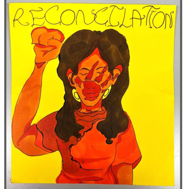
Artist-Channelle River Sanderson