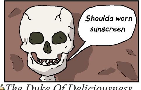
The Duke Of Deliciousness "Shoulda Worn Sunscreen"