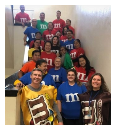
*Members of our student council and staff participating in our annual spirit week