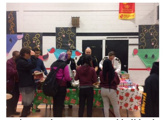
*Students and community members at our annual holiday luncheon