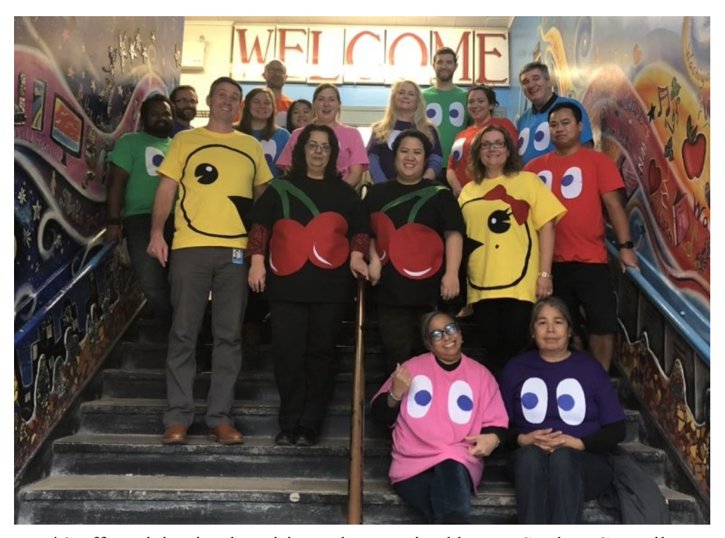
*Staff participating in spirit week, organized by our Student Council

Many teachers use Google Classroom to help students access academic activities and keep track of homework from home. Parents may access the online classes and communicate with teachers through this program. Teachers will inform students on how to access activities and will provide them a username, password and class code. Please see homeroom teachers for more information.