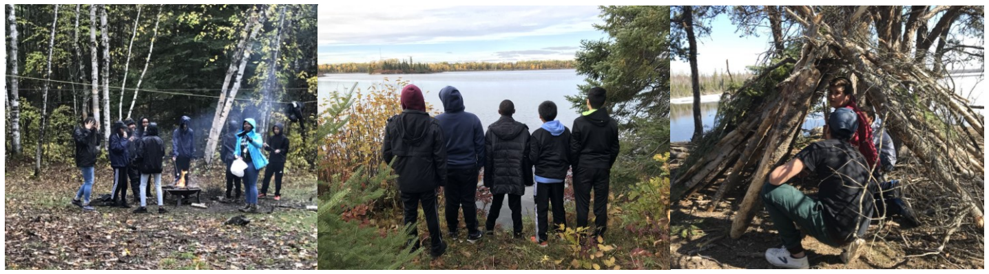
*Students attending our yearly camping trip

The resource program is designed to assist students who require additional time to complete course requirements, have experienced limited academic success, lack motivation or are identified as having a learning disability. A resource teacher or educational assistant can support students with completing assignments, developing organizational skills or problem solving skills, or improving reading skills. A student may access resource support through their classroom teacher.