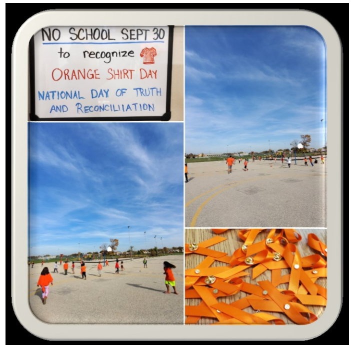
Orange Shirt Day