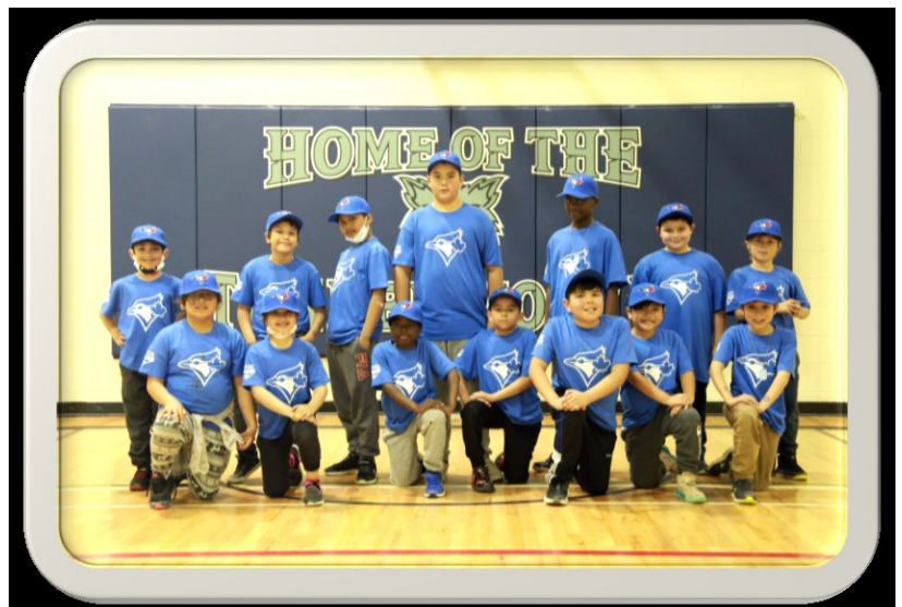
Jays Care Baseball Program