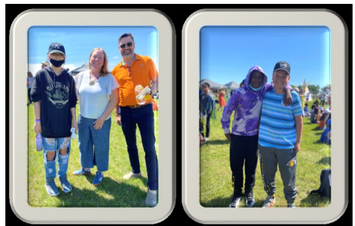
Divisional Pow Wow