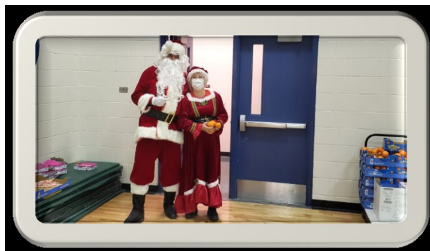
Breakfast with Santa