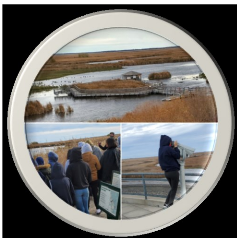
Oak Hammock Marsh