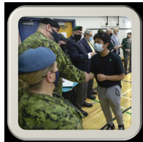
25th Anniversary Red River Flood Event