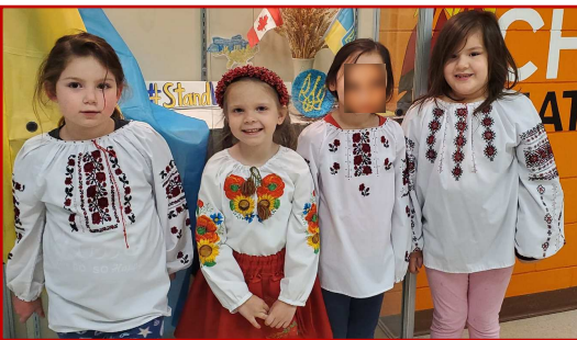
Staff and students celebrating Vyshyvanky day in style!

Below: Handicraft sale to raise funds for Ukraine relief. Right MPUE representatives came out to congratulate our departing Grade 8 students.