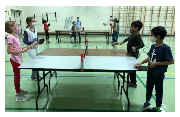
Table Tennis at a distance