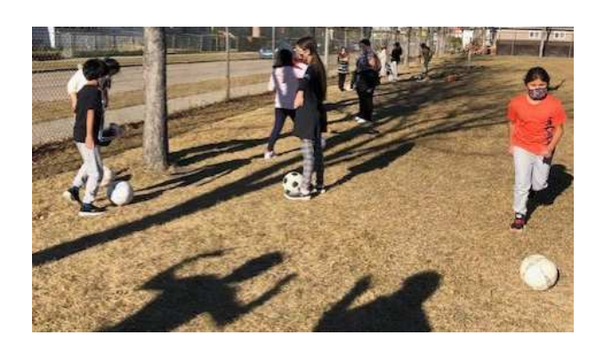
Soccer and social distancing