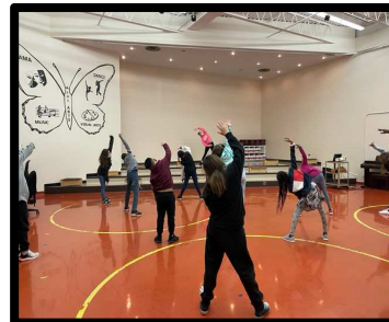
Physical Education and Arts Programming