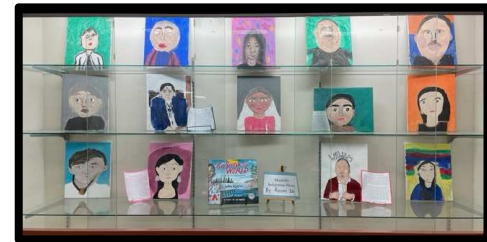
ESD and Truth and Reconciliation