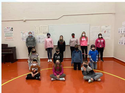
Student Council 2021-2022

Inclusion Support Services, CSS Services, Vision & Hearing Screening, Dental Outreach Program, In-School Daycare: Poplar Avenue Kids Care