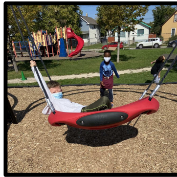
Playground upgrade included new swings!