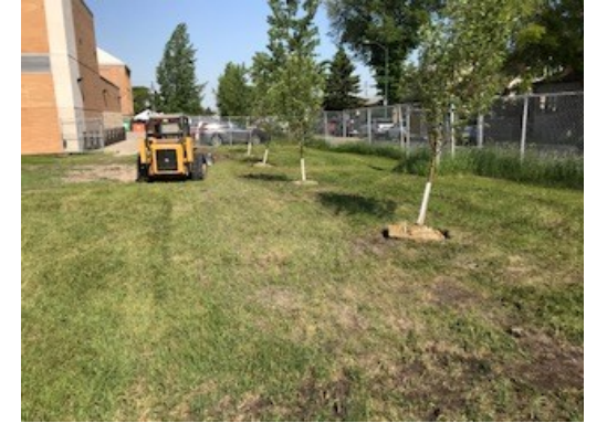
We are taking the initiative to beautify our playground and school yard over the next few months