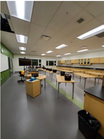
A Science Lab