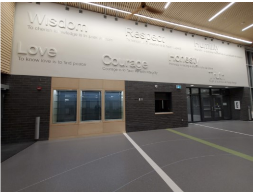
Seven Teachings Wall