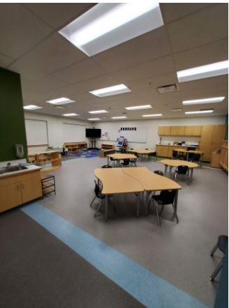
A Nursery-Kindergarten Classroom