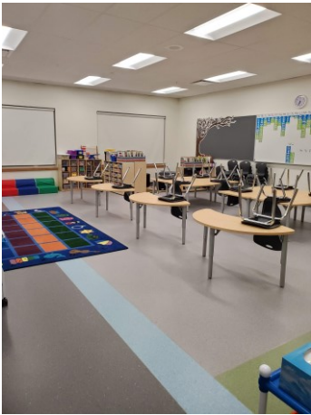
A Typical Classroom