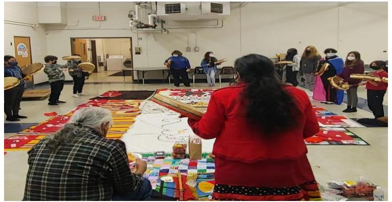
Music Equals: Drumming