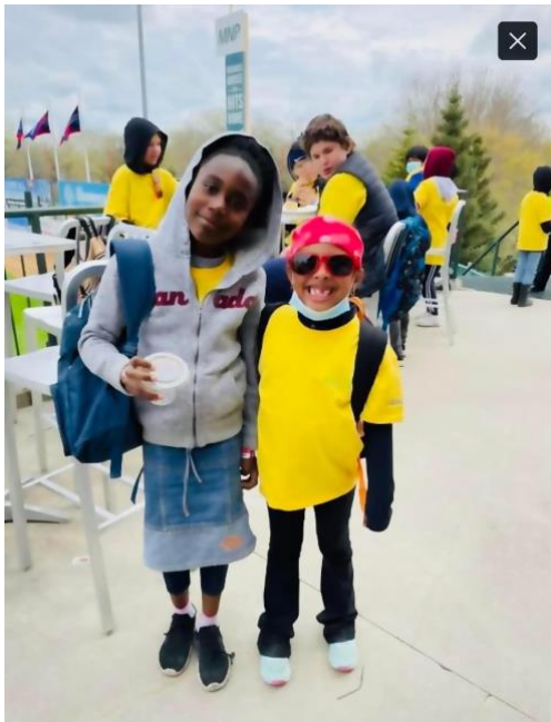
Goldeyes Game: Qualico