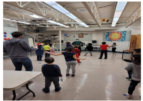
Music Equals: Musical Theatre