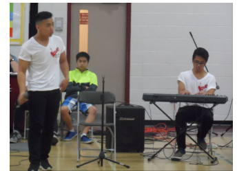
Page 8: Finest in a Frenzy!