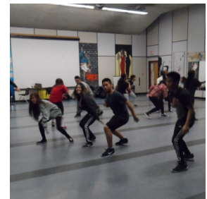
Page 9: STAR WARS