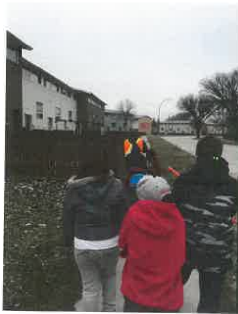
Shaughnessy Walking School Bus

https://www.winnipegsd.ca/schools/shaughnessypark/Pages/default.aspx